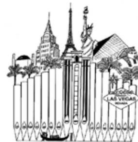
Southern Nevada Chapter American Guild of Organists