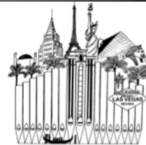
Southern Nevada Chapter American Guild of Organists