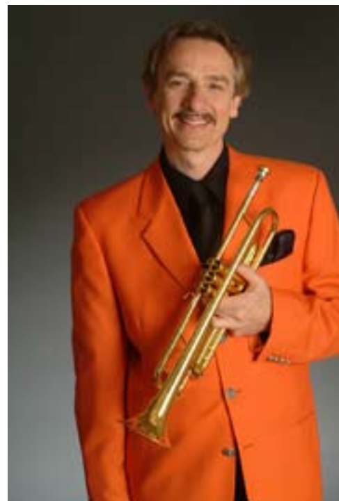
Performing Artist - Allen Vizzuti