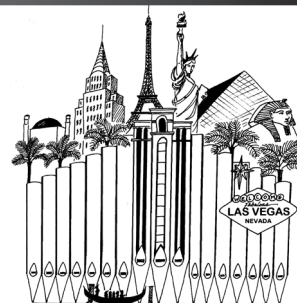
Southern Nevada Chapter American Guild of Organists