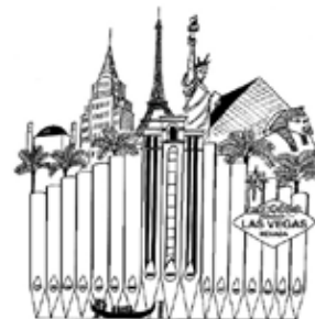
Southern Nevada Chapter American Guild of Organists