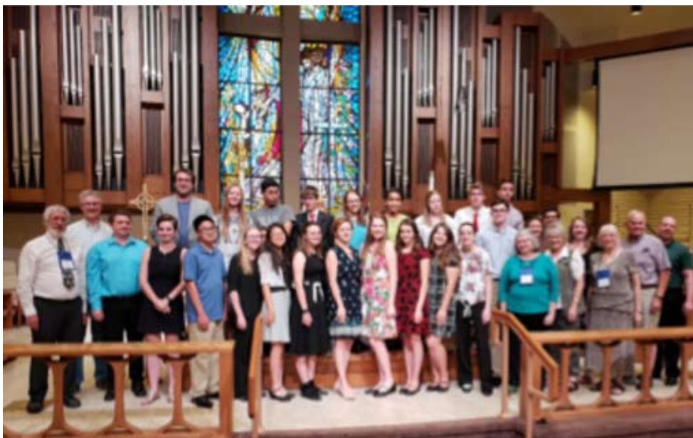
POE Phoenix – Students, instructors and organizers. It took this entire team to create a great POE experience for the 16 students.