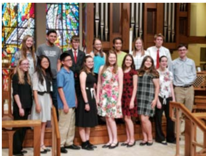
POE Phoenix – Students. 16 students from 6 different states (with 4 from Nevada)

As the week went on, I felt more comfortable and came to realize my POE experience would be something I would not soon forget. The people I met, both the participants and the instructors, helped me to feel more comfortable and find more enjoyment in the experience. The POE allowed me to meet and create friendships with other organ students (who were my age!!!) I only could meet through an event like POE. I am also thankful that the POE allowed me to meet and create friendships with other professional organists who volunteered their time to help me become a better musician and organist.