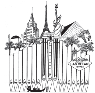
Southern Nevada Chapter American Guild of Organists