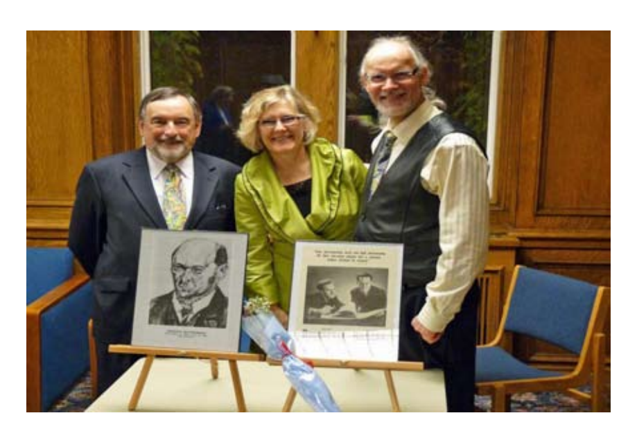
Tuesday, September 13, 7:30 P.M. Doc Rando Recital Hall

Schönberg's Op. 40: "Variations on a Recitative for organ"